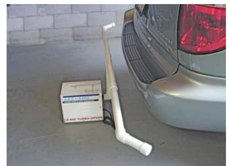
Air Tubes can be set up any way you like, or make your own with Standard PVC Pipe.