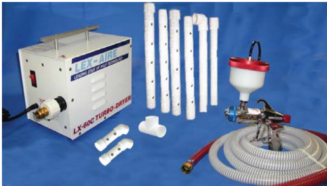
Complete Combo Mobile Package