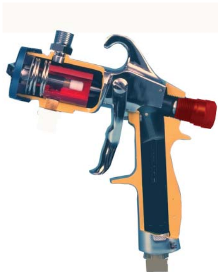
Simple, Rugged Gun

LEX-AIRE has the highest quality, best made components in the industry.