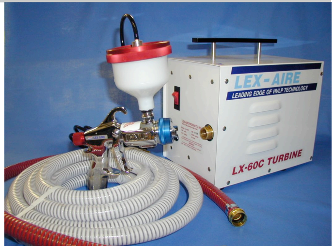
LX-60C Pro-Mobile Package Shown